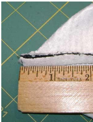
SEW YOUR FLAP ON YOUR BAG: