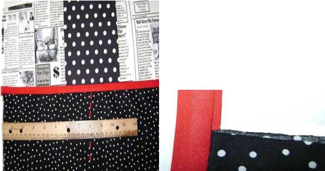
binding attached to top of pocket