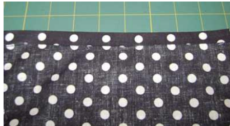
Fold over lining at top