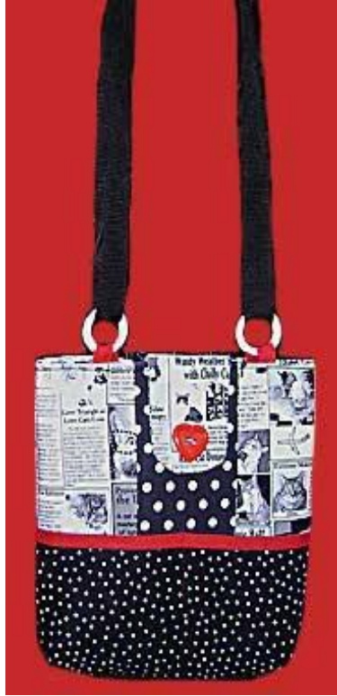
Your completed bag!