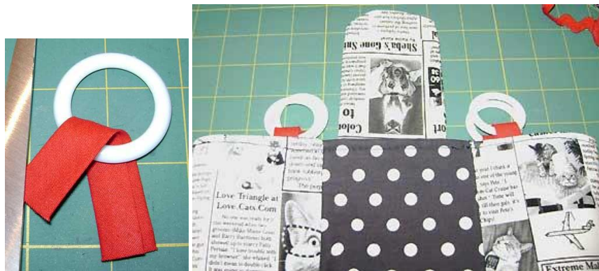
Add rings \frac{5}{8} " out from center panel (polkadots panel)